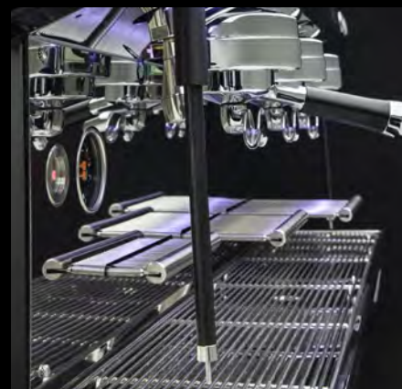
Latte Art Teflon option